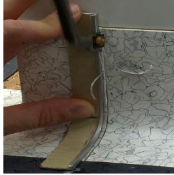
Groove the joint