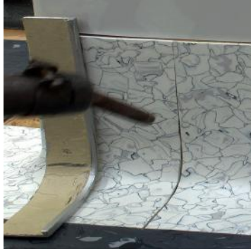
Heat the joint