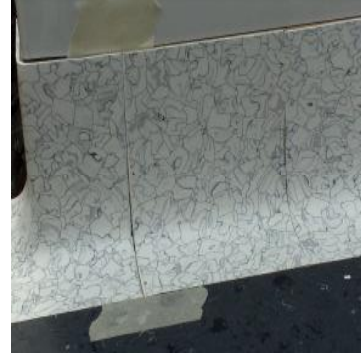
Protect the parts that don't need welding with adhesive tape.