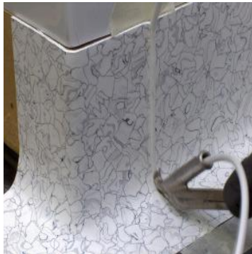
Weld with appropriate PVC weld ( hot air 300/350 °C)