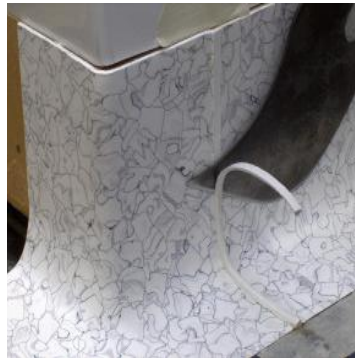
Once applied roughly remove the excessive weld.